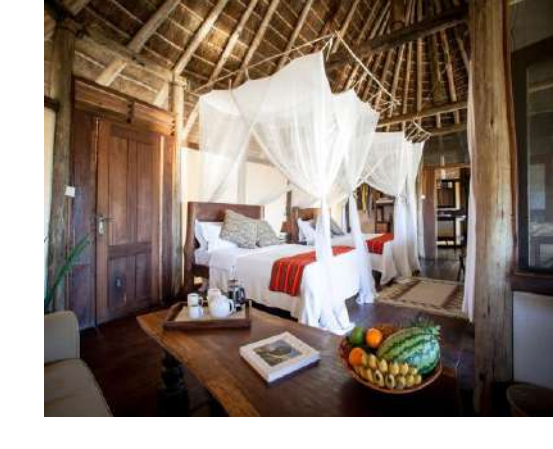
DAY NINE Kibale Forest

In the afternoon, enjoy a Nile launch cruise to the bottom of the water falls for game viewing at close quarters, then depart at the bottom of the falls and hike up to the top of the falls where you will be rewarded with amazing views of the Nile.